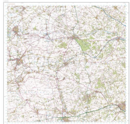
Illustration Of Map Coverage