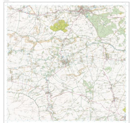
Illustration Of Map Coverage